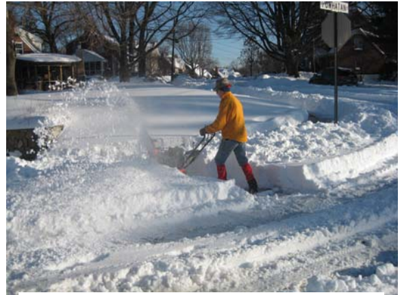
Volunteer snowman at work

Thanks are due to our Volunteer Snowmen who donate their time and energy to this worthwhile winter project. If you have sidewalks along your street that do not get properly cleaned after a snowstorm, volunteer to become a Snowman and make a difference in your neighborhood. Call 703-532-6101 to volunteer.