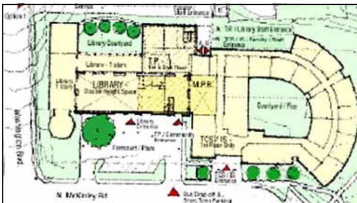
Scheme E is one design being considered for the complex.

Several new alternative designs for the joint facility can be viewed on line at http://www.arlington.k12.va.us/facilities/design/Reed/work%20session%20%20slides.pdf . The MOA between County and Schools is available at http://www.arlington.k12.va.us/facilities/design/Reed/