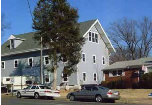
The house at corner of Sycamore and N. 27 th Sts.

curb the most egregious types of excess coverage. One deficiency recognized by all was the current lack of any separate coverage limit applying to the home itself as opposed to the total coverage on the lot. Under the current rule, an owner or developer can, by right, cover up to 56% of the lot with home or pavement or a combination of the two. While the storm water runoff effects of the two may be similar, the visual appearance can be dramatically different. Fortunately no house in Leeway Overlee appears to approach the 56% coverage allowance. But at least three homes have, due to their extensive asphalt areas, reached 56% total coverage. This has caused some storm water problems for numerous homes down hill from this new construction.