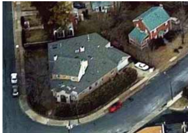
The house near Lee Highway and N. George Mason Dr.

north of Lee Highway (behind the Caribbean Grill). It is called "hacienda house" by some locals. It is a standard post-World War II colonial home that has been