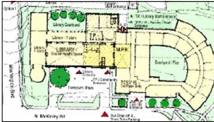
Scheme E is one design being considered for the complex.

Several new alternative designs for the joint facility can be viewed on line at http://www.arlington.k12.va.us/facilities/design/Reed/work%20session%20%20slides.pdf . The MOA between County and Schools is available at http://www.arlington.k12.va.us/facilities/design/Reed/