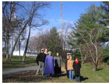
Leeway Overlee officers and neighbors examine the WAVA tower site.

WAVA Building Limited Partnership (WAVA BLP) applied to the County in mid September for replacement of its 22-year-old radio tower at 5232 Lee Highway. In place of the guy wire-supported thin tower, the owners have proposed a self-supporting tower of the same height (426 feet). After the civic association received notice