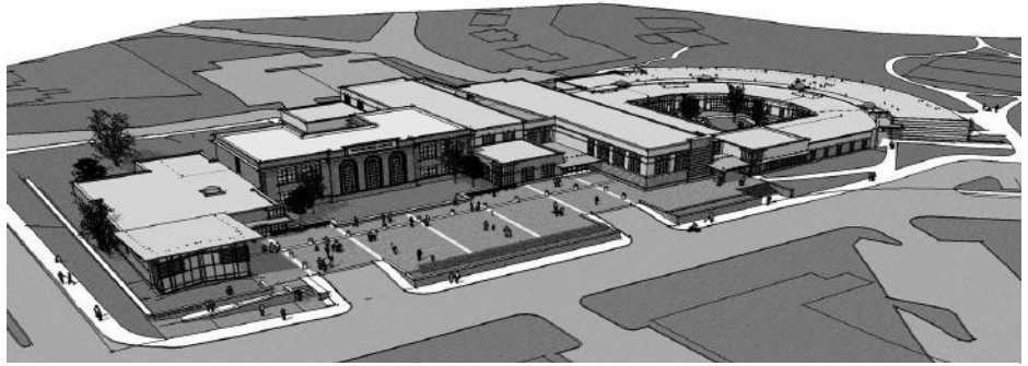
Pictured above is the current overall design for the Westover/Reed site.

Final design is wrapping up on the Westover Library/ Reed School joint facility to be operated by the County and by the Arlington Public Schools. The latest drawings further develop the North McKinley Street plaza to improve it as a place for pedestrians. The vehicle turnaround area earlier planned for the front has been eliminated in favor of greener elements. The latest design also makes changes to the Washington Boulevard façade to improve its relationship to the street and sidewalk and make that side of the building more welcoming and enhance the pedestrian experience. The pedestrian and bicycle connectivity of the back of the facility to Washington Boulevard has been improved.