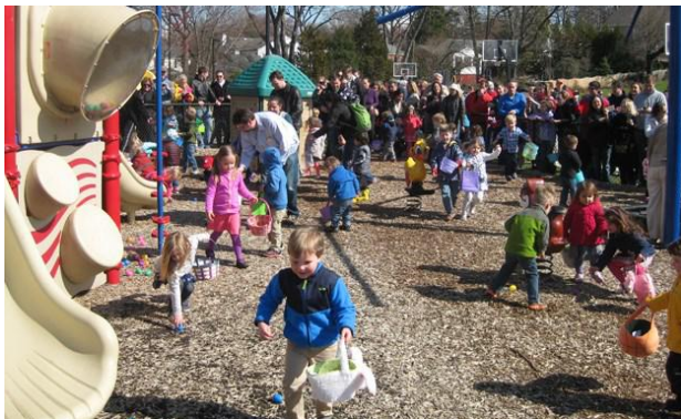
The search is on at the Westover Easter Egg Hunt

The coming November local elections promise a turnover in elected officials. Two new County Board members and a new School Board member will be chosen by Arlington voters. The absence of incumbents is an uncommon event. Our spring meeting will give an opportunity to meet, hear, and evaluate the announced candidates for these offices. See the related article on page 3.